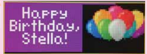
Happy Birthday on the School Marquis