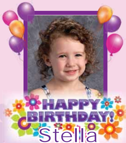
Happy Birthday on the Bulletin Cover