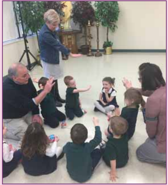
A Blessing for the Birthday Girl!