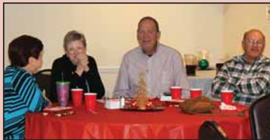
Our St. Vincent de Paul Volunteers