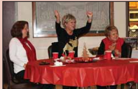
Parish Staff and School Faculty having fun at their tables