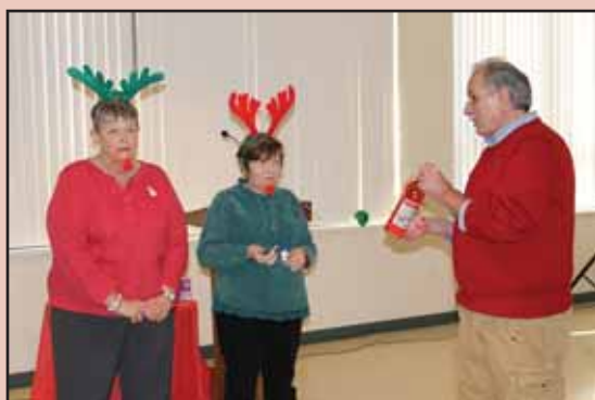
St. Vincent de Paul Volunteers getting ready