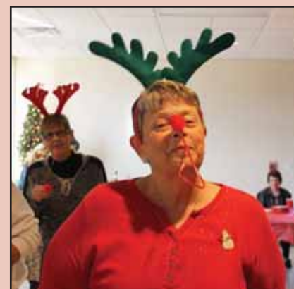
St. Vincent de Paul Volunteers becoming Rudolph