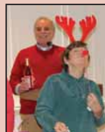
Parish Staff, Teachers and St. Vincent de Paul volunteers