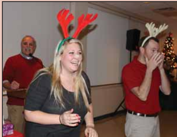
Teachers getting ready for their Rudolph nose