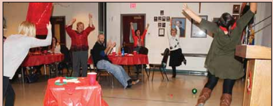
Parish Staff table wins!!!