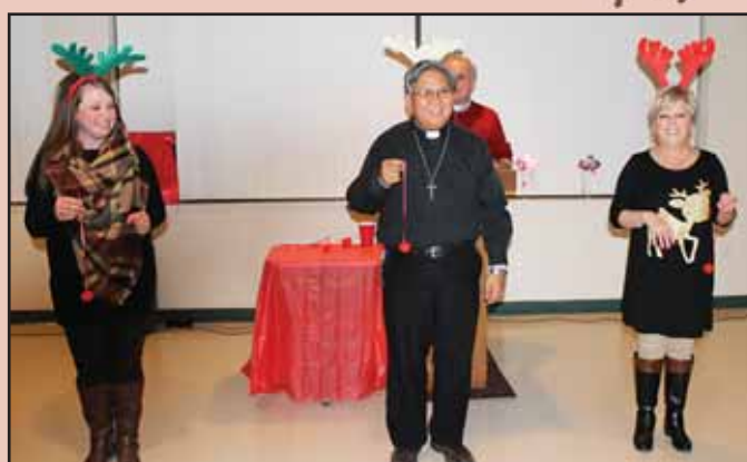
So, a school board member a priest and a principal put on some antlers...