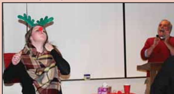
School Board getting in on the fun