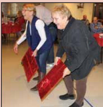
St. Vincent de Paul Volunteers