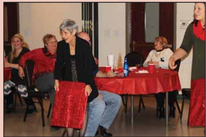
Parish Staff and School Faculty racing to the finish!